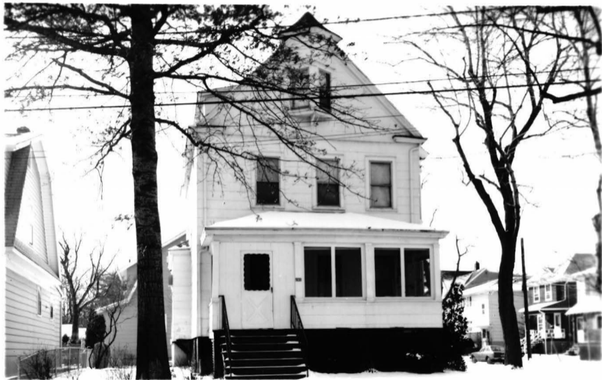
MONTCLAIR BOARD OF REALTORS

42621 500 IRVINGTON AVENUE, MAPLEWOOD +: